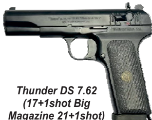
Thunder DS 7.62 (17+1shot Big Magazine 21+1shot)