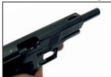
4. Fig. 2