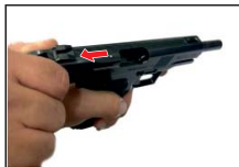
4. Fig. 1

NOTE: In normal operation, when the slide is released from the open position and is allowed to return to the fully closed position with the decocking safety lever in the down (SAFE) position (as shown in 4. Fig. 2), the hammer will fall against the decocking safety body.