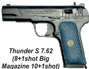
Thunder S 7.62 (8+1shot Big Magazine 10+1shot)