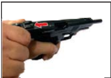
7.4. Fig. 1