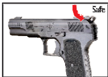
4. Fig. 6