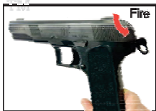
4. Fig. 5