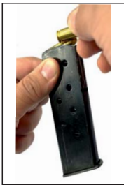
(6.1. Fig. 1)

Load the magazine by pressing a cartridge base (rear of cartridge) downward on the forward portion of the magazine follower (or downward on the case of a previously loaded cartridge) and sliding the cartridge fully under the lips of the magazine until the cartridge base is against the rear wall of the magazine. Repeat the procedure for the number of cartridges you wish to load, up to the magazine capacity (6.1. Fig. 1).