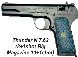
Thunder N 7.62 (8+1shot Big Magazine 10+1shot)