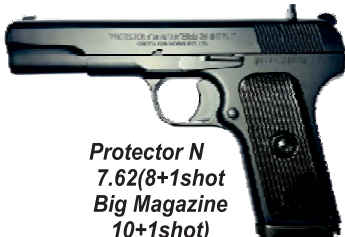
Protector N 7.62(8+1shot Big Magazine 10+1shot)