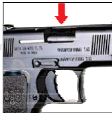
2. Fig. 1

In some cases, a round of ammunition not specified on your firearms may fit into the chamber. Firing ammunition not specified on your firearms may cause it to rupture and cause serious injury or death to you or others. Always inspect your ammunition before using it. Never use dirty, corroded or damaged ammunition which can lead to a burst cartridge which may cause damage to the firearms and personal injury or death.