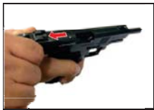
4. Fig. 4

• Your pistol may have a red dot, which is totally visible when the safety decocking lever is in the (FIRE) position; however, do not rely on your inability to see a red dot as the only indication that the safety decocking lever is engaged.