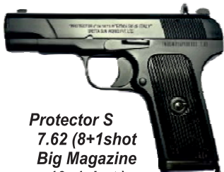
Protector S 7.62 (8+1shot Big Magazine 10+1shot )