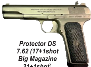
Protector DS 7.62 (17+1shot Big Magazine 21+1shot)